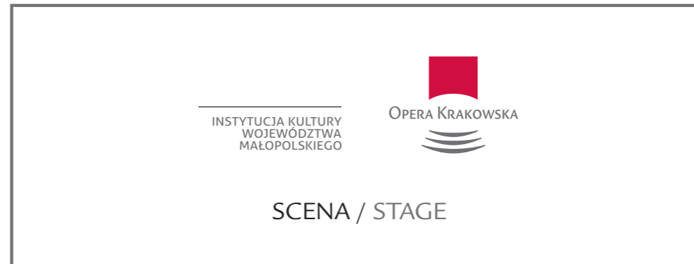
sektor A / sector A