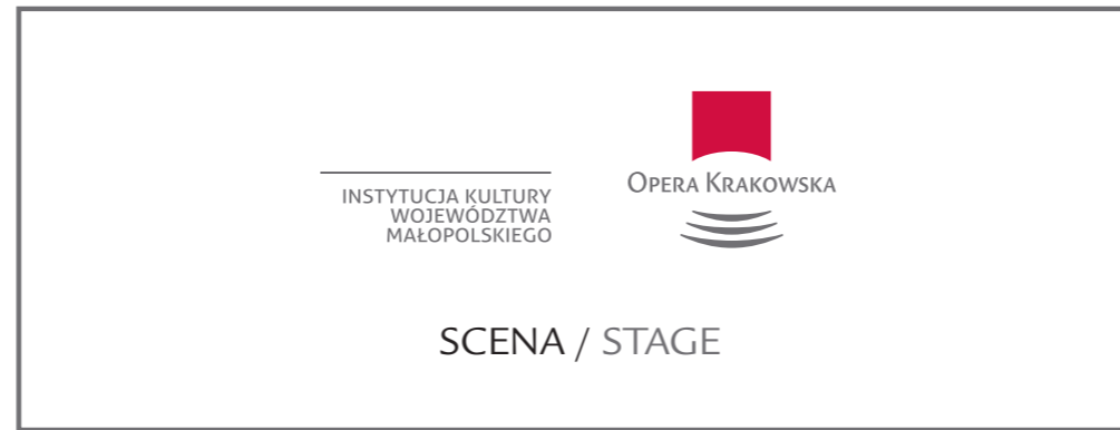
sektor A / sector A